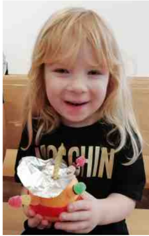
Christingle at Alhaurin