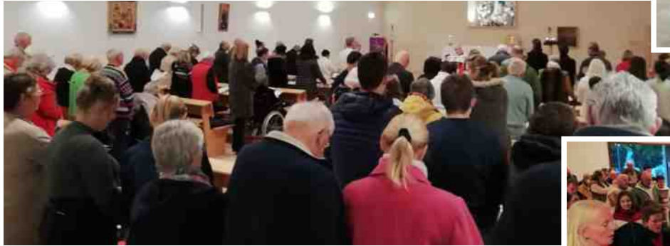
Carol Service at Alhaurin