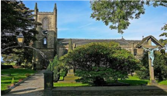
St Anne in the Grove, Southowram