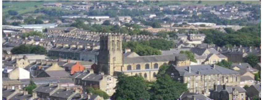
St Paul, King Cross